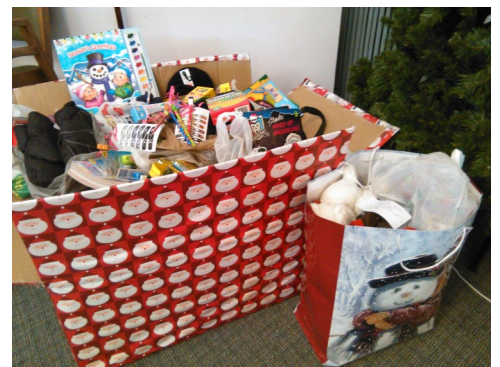
Last year's donations to the Rainbow Youth Centre overflowed a massive box. What Christmas spirit!

Thank you for supporting this project in keeping with the true meaning of Christmas!