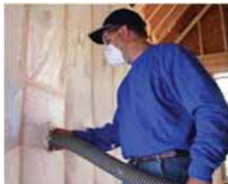
Blow Behind Netting