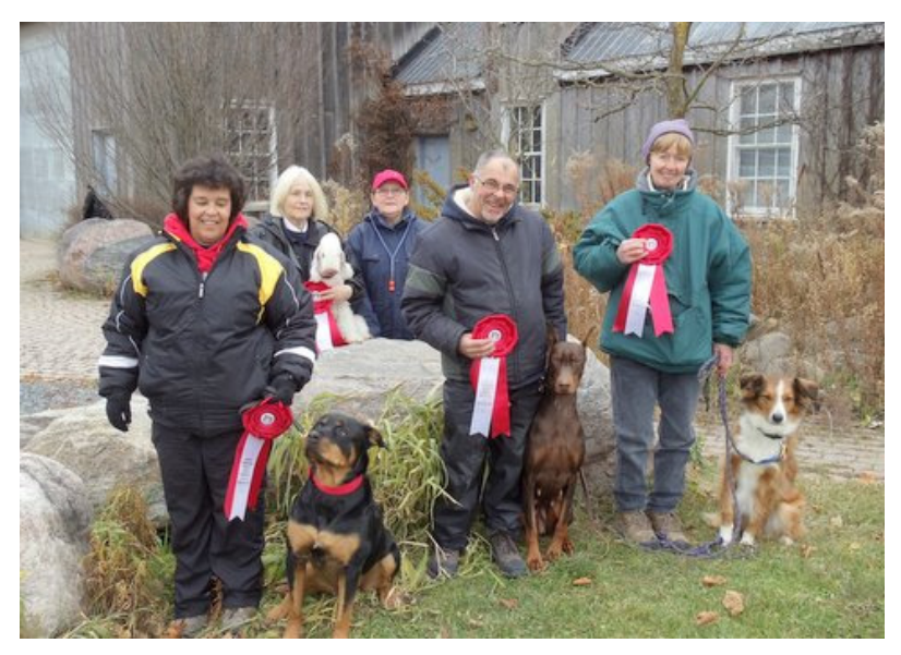
NAMBR Fall TDX Test