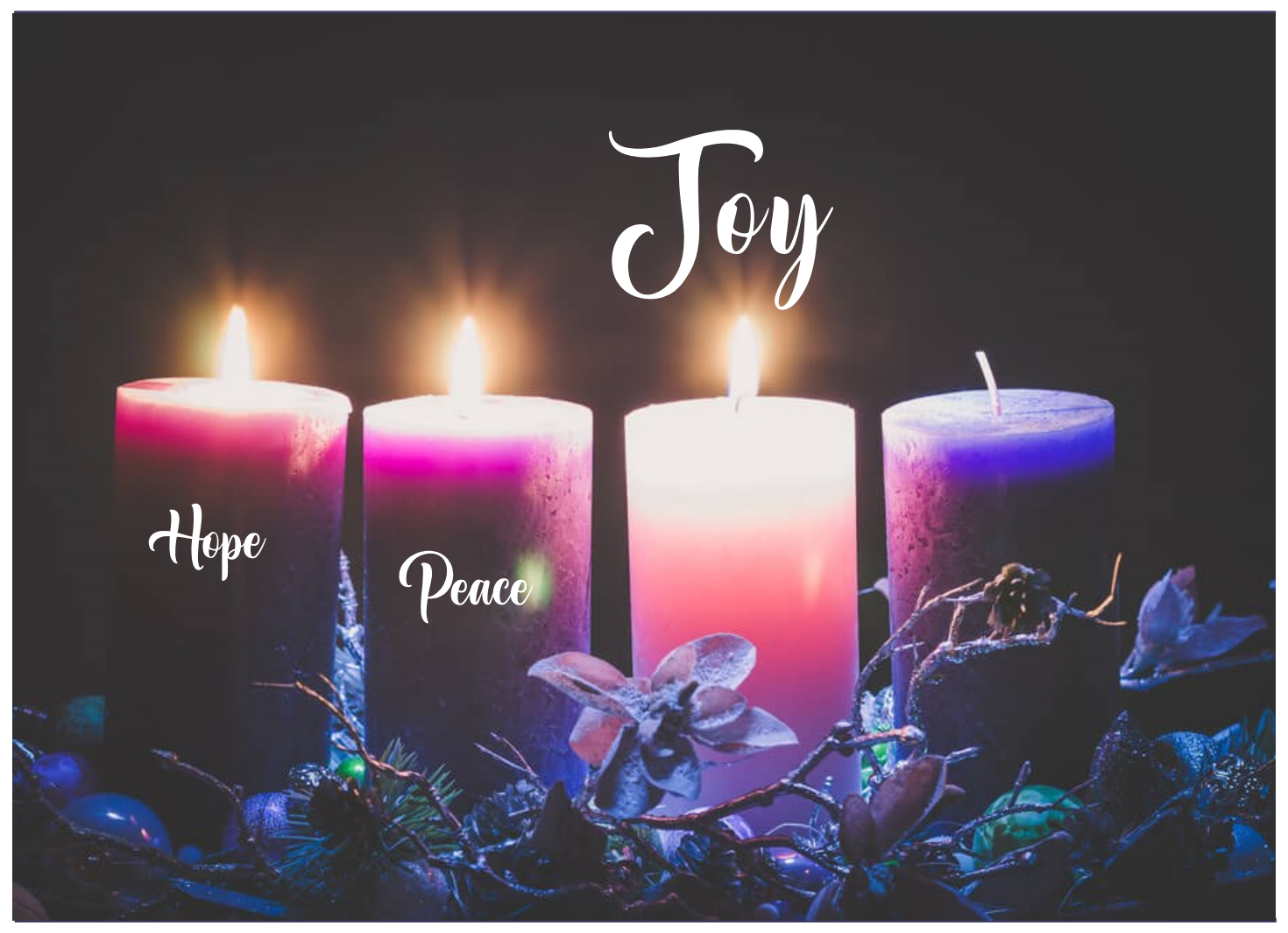
May You Find Christ Here... May You Bring Christ to the World!