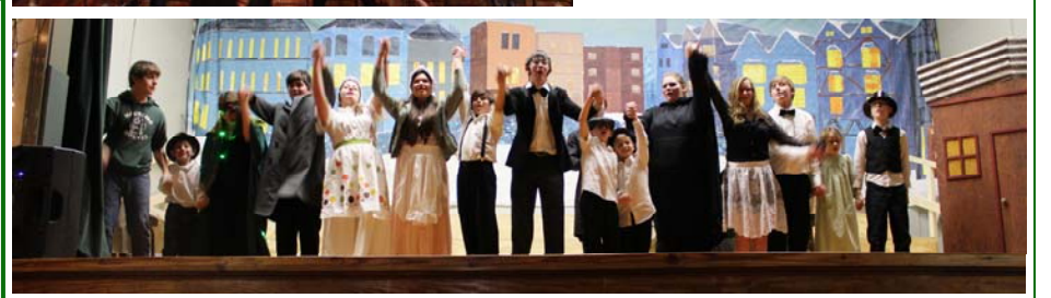
Once again, Thank you