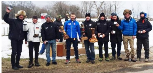
DN North American podium finishers