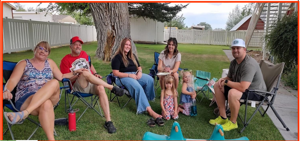
The Bolding, Powell families enjoying the church picnic!