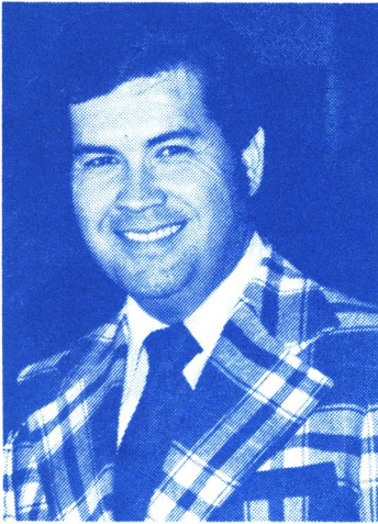
Superintendent and Choir Director