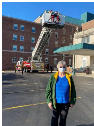
Char is being interviewed by the T.V. station