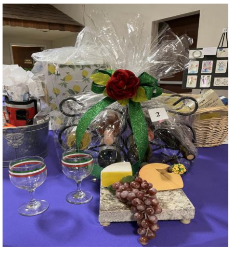
This is only one of our many impressive baskets and other creative and generous items donated by our local lodges for the auction.