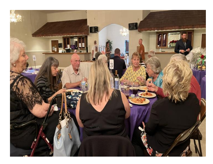
Giuseppe Verdi Lodge