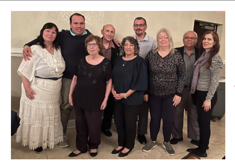
Italian Heritage Lodge