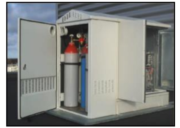
Fig. 2 - TETRA Fuel Cell Experiment