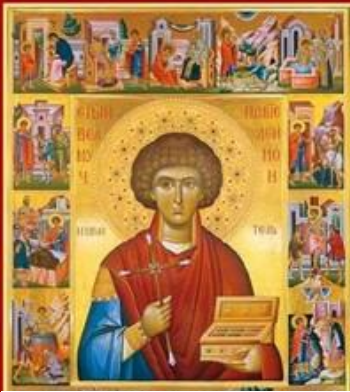
Gr. Martyr and Healer St. Panteleimon

PLEASE PRAY FOR HEALING, COMFORT, AND SPIRITUAL PEACE