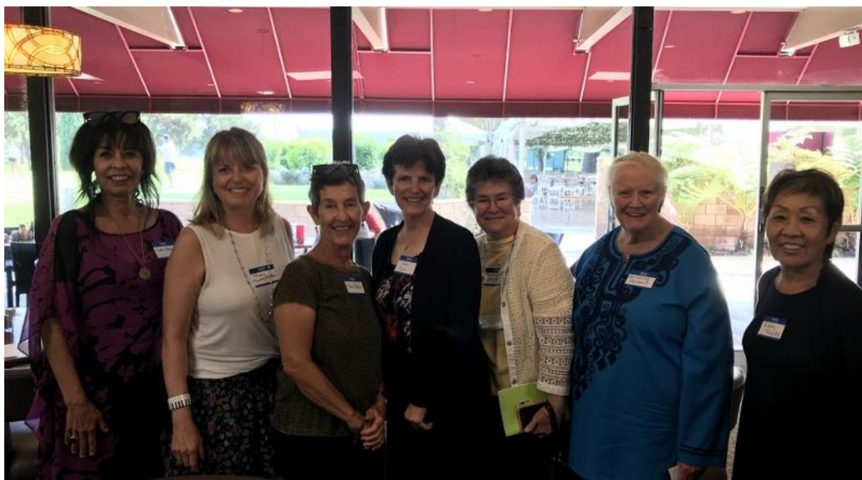
New Members Luncheon September 25, 2021 – El Dorado Golf Club Restaurant