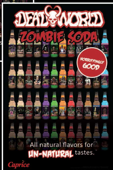
POSTER 3 Horribly Good