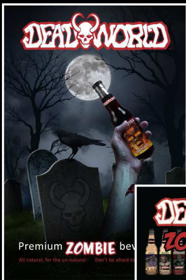
POSTER 1 Grab a cold one