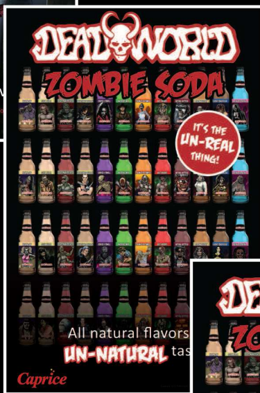
POSTER 2 It's the un-real thing!