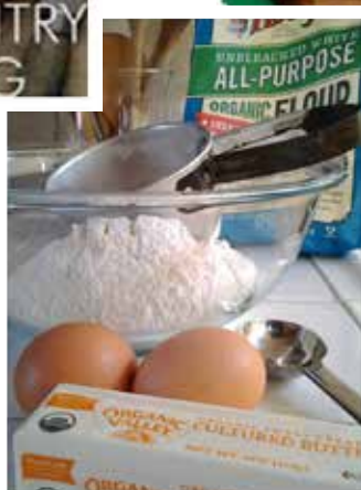
LEFT: Gather the ingredients