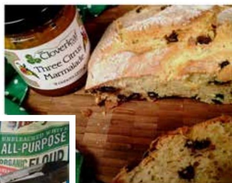
ABOVE: Share the results