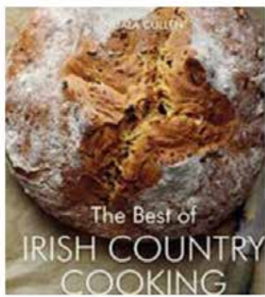
ABOVE: Visit the Library to find a great recipe

Calaveras County Friends of the Library PO Box 1552 San Andreas, CA 95249 (209) 754-6510 calaverasfotl@gmail.com calaverasreads.org