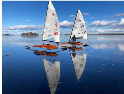
Pushaw Lake, first Ice. Dec 13, 2023