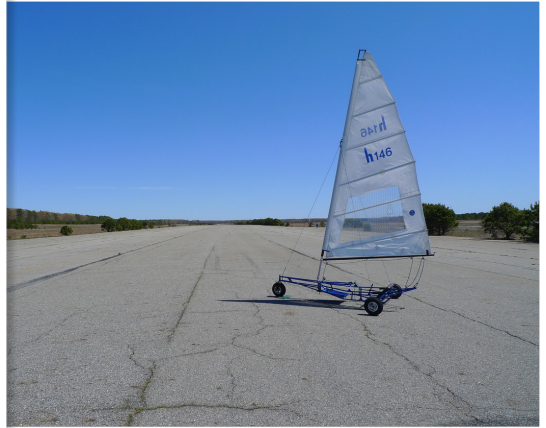
At Grumman airstrip