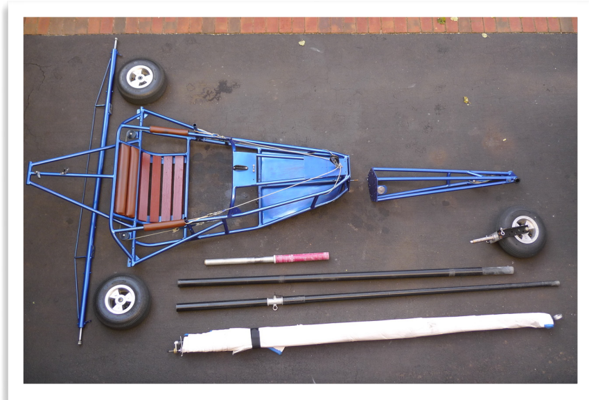
One off design and build, breakdown for transport.