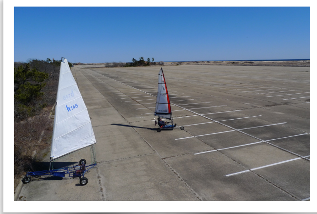
Video here of Scott sailing Jones Beach <u>https://youtu.be/Xm-rF-zO4-g?</u>