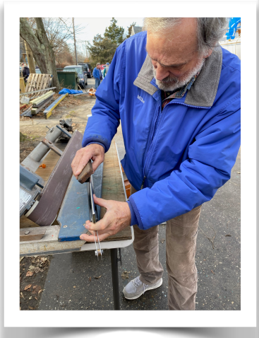
Club Sharpener Will be available at monthly meetings!