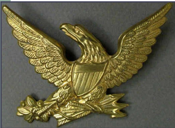
Photo of 1820s Infantry cap badge.