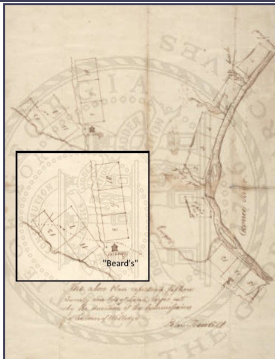
1806 plat of Milledgeville depicting a structure identified as "Beard's" along a tributary of Fishing Creek.

Therefore, I contacted an independent researcher from