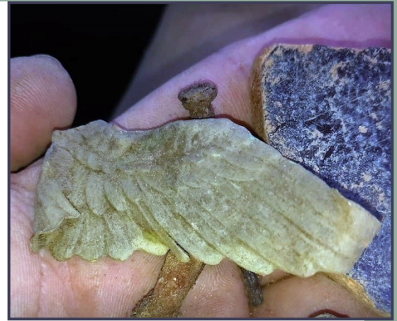
Artifacts recovered during metal detection by Dutch Henderson: brass wing fragment, cut nail, and blue glazed ceramic. They could be dated from as early as the 1820s

Dutch's next plan is to look at the spot on the map that is actually marked with an asterisk as "Beards." I now suspect that this is not a blockhouse, but supposed to be Beard's house—as it is situated along the creek and not on the bluff above. It is now fairly clear that the insignia probably was lost by one of the guards from the prison. Bonner's article also mentions the prisoners working in a vegetable garden outside the prison's walls, which could have been where the cow pasture now is now located. A question does remain about the insignia, however. According to Bonner, the guards wore State Militia uniforms, but the insignia has only been identified as belonging to the Legion of the United States, the Federal Army. Furthermore, it is not clear why the guards' uniforms would have included a cap with an infantry insignia! ■ JJD