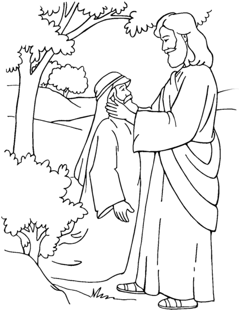
Jesus Heals a Deaf Man Mark 7:31-37

Each number represents a letter of the alphabet. Substitute the correct letter for the numbers to reveal the words.