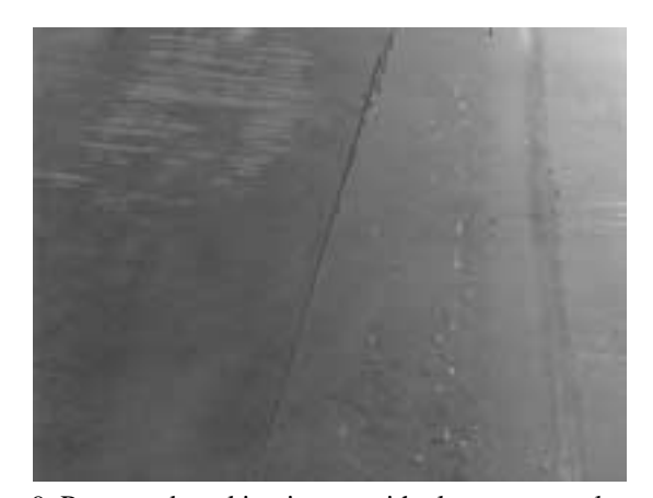
15% Remaining 51% Remaining