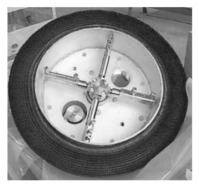
Fig. 5. Vacuum shroud with 10-jet spray bar configuration.

When driving on vertical surfaces, the magnets must provide sufficient normal force to develop the traction to pull the robot plus the weight of cables and hoses, up the side of a ship. Weld beads or other obstructions increase required tractive effort. Since smooth paint, water and oily residues result in low