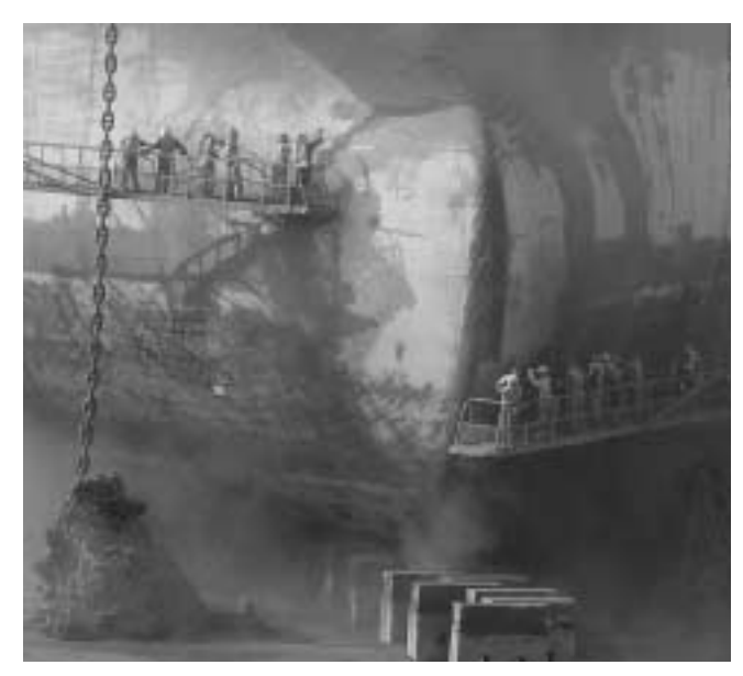
Fig. 1. Grit-blast crew at work.

toxic hull coatings into a fine, airborne dust. Despite tenting procedures, a great deal of this toxic dust still ends up in workers' lungs, in surrounding communities, and in bays, rivers, and oceans. The second problem is disposal of the thousands of tons of grit that is contaminated with paint residue. Stripping a large ship generates in excess of 3000 tons of grit. In many locales, disposal of the grit is a serious environmental and cost issue.