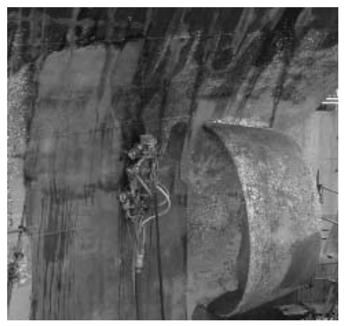
Fig. 7. M2000 stripping stern of a cargo ship.

To provide the required maneuverability, the machine is designed with four-wheel steering. For strength and simplicity, the machine uses solid half-axles which counter-rotate to steer like an airport baggage cart. While this allows very tight turning, it also requires the use of differentials to prevent skidding of the wheels during turns. The two small differentials have a