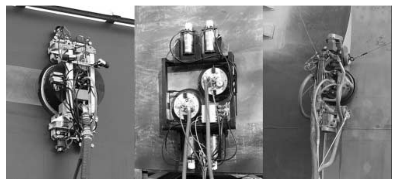
Fig. 3. The three versions of the NREC-UltraStrip Systems robot chronologically from left to right. The wires in the right-hand image are passive inertial safety reels to catch the robot in the event of a fall.