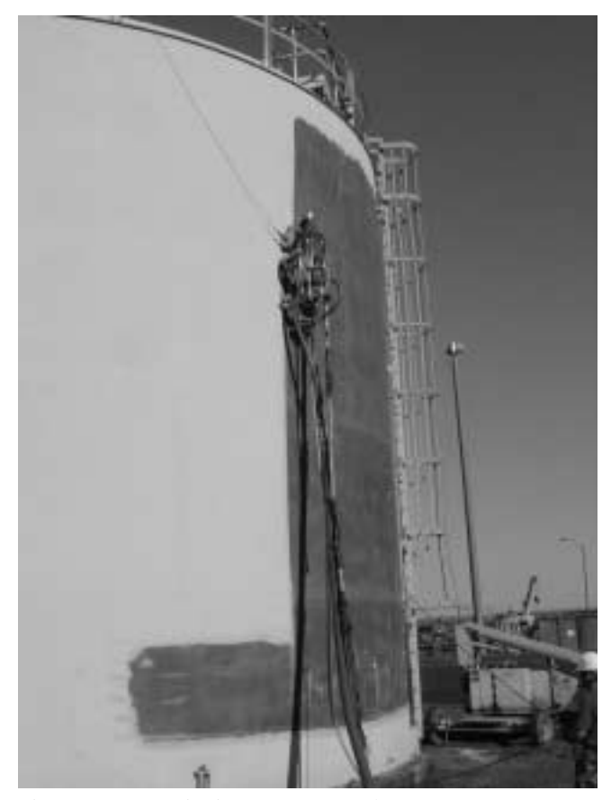
Fig. 6. M2000 stripping a storage tank.

paint thicknesses up to 6.3 mm, which create a large gap between the magnet and steel, thereby significantly reducing the magnetic force holding the robot in place. The large normal force provided by the magnets allows the robot to drive confidently on smooth, wet, and even oily surfaces while supporting its long and heavy tether.