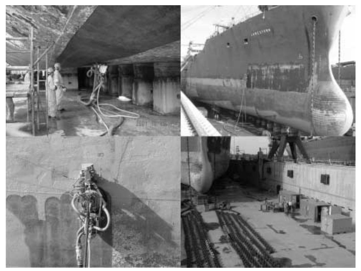
Fig. 11. Clockwise from top left: under-hull operation; sweeping the bow; dockyard with pump and vacuum containers; stripping failed coating.

vacuum-attached machines. We ran both machines on our test wall and challenged them to perform several typical stripping, sweeping and spotting tasks. In this competition, the M2000 was consistently faster than the vacuum-attached machine and was a great deal faster sweeping and spotting—tasks which require speed and agility. Due to the smoother operation and more accurate control, the M2000's sweeping results were also considerably better than the vacuum-attached machine which heavily scored the steel as it started and stopped.