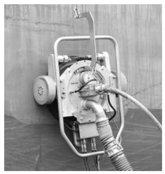
Fig. 2. Commercial vacuum-attached machine.

At the National Robotics Engineering Consortium (NREC), we tested three of the commercial stripping machines. The machines were tasked with stripping typical epoxy-based ship coatings from an approximately 200 m<sup>2</sup> steel test wall, which includes convex and concave curves, and vertical and horizontal (upside down) surfaces similar to those found on typical large ships. In all cases, the machines were driven by experienced professional operators. The machines were timed and video taped while stripping a variety of pre-measured areas. This allowed us to compute throughput in terms of square meters stripped per hour.