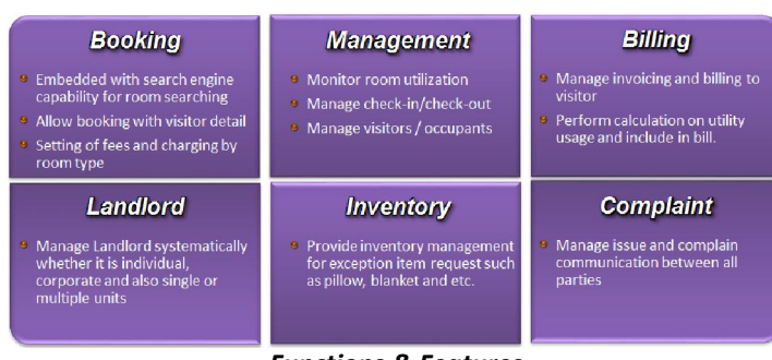
Functions & Features

Our solution promote paperless and eliminate manual operation. Optional integration with payment gateway make available to business owner if they do have intention to allow online booking and make payment.