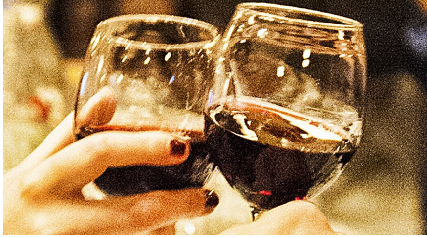
sen by the sommelier. Overnight in Avignon.

1335 by pope Benoît XII with the "Old Palace" and continued by his successor Clément VI who added the "New Palace" – this monumental building is the most stunning Gothic ensemble of the Occident. Visit of the Palace.