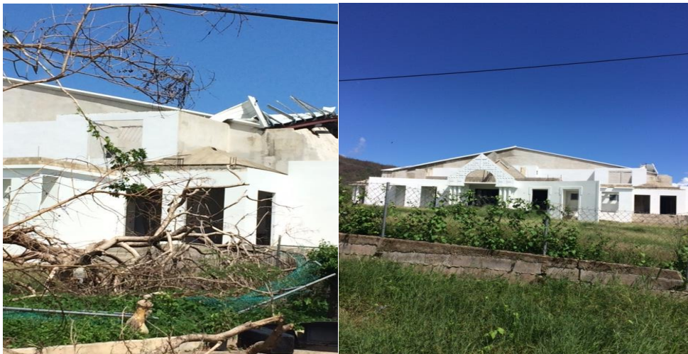
Villa Fontana UMC (North East)