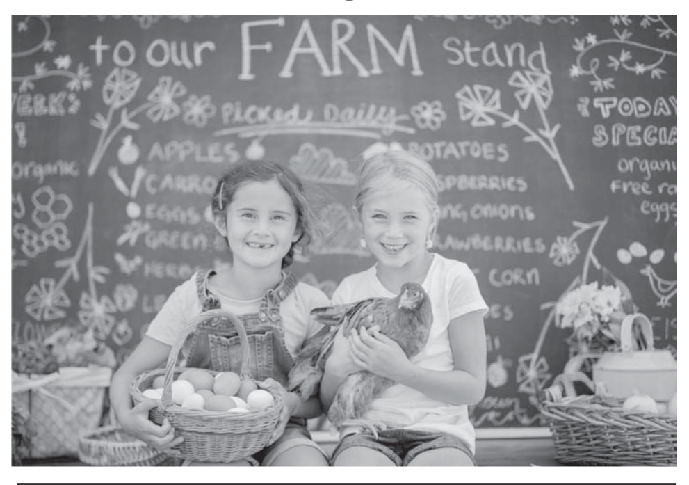
Shop local! Head to a Farmers Market for your next shopping trip.

The saying April showers bring May flowers couldn't be more true this year. April had some major rain days and it seems to have brought more green, more flowers, more mowing, and more signs of the warm weather season.