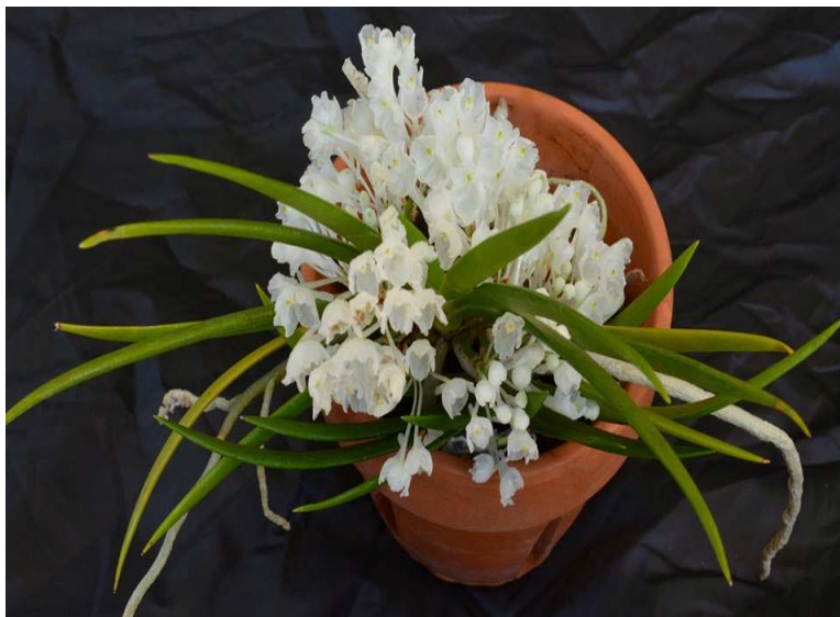
Podangis dactyloceras 'Dink Dink' CCM/AOS