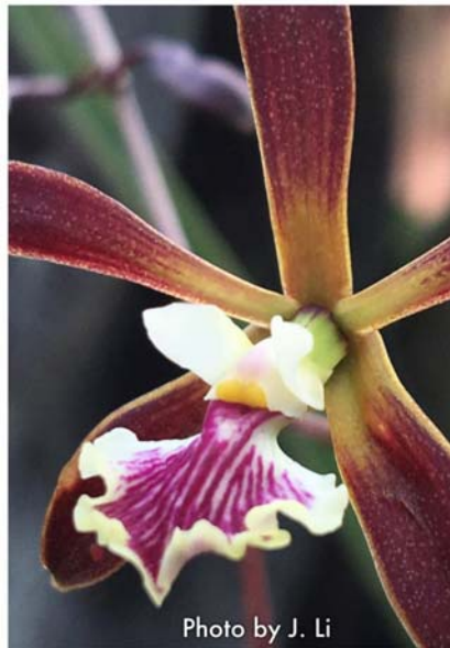
Summer stars 'Jungle Night