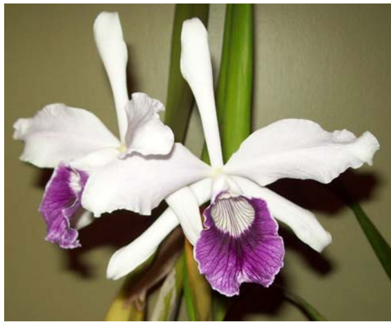
Laelia purpurata fma. schusteriana (now Cattleya)