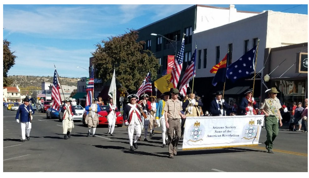
AZ Society CG marched and rode in the Veterans Day Parade in Prescott. This was the largest number of our Representatives in this parade. Findley Buick loaned us Red, White, and Blue Convertibles for this event.