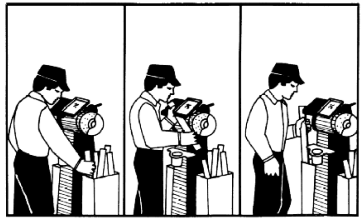
Figure 3. Grinding Castings: New Procedure or Protection

Figure 3 identifies the basic job steps for grinding iron castings and recommendations for new steps and protective measures.