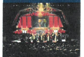
Famous Grand Ole Opry.

$75.00 Deposit due by January 3, 2021. Full Payment due by March 3, 2021.