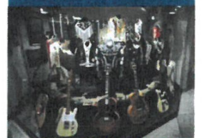
Country Music Hall of Fame.