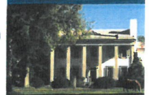
Belle Meade Plantation.