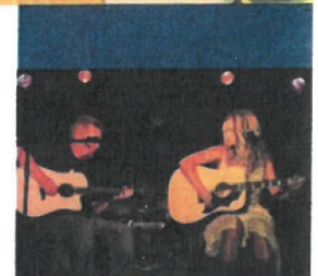
Nashville Nightlife Dinner Theater.

Diamond Tours inc. Bringing Group Travel to a Higher Standard®