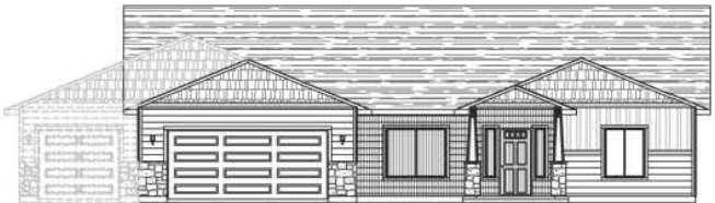
ELEVATION "D" Optional 3rd CAR GARAGE Available w/ All Elevations

This is being provided to you as a sales tool to assist in your buying decision. The exterior view is an artist's conception that may vary in detail from the actual house. This drawing is the property of White Diamond Construction. It shall be treated as confidential and must not be used to our disadvantage. It shall neither be reproduced nor altered, nor made available to third parties without prior written consent