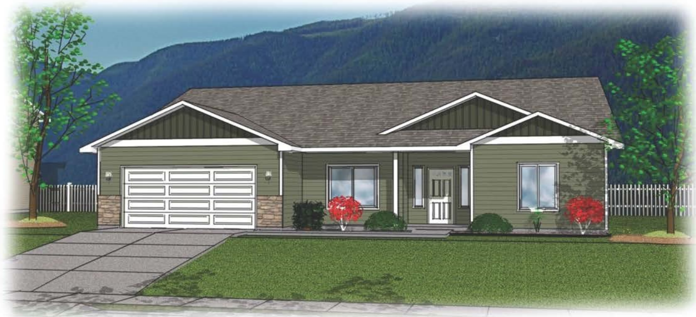
(Color combinations for brochure use only)

All measurements, dimensions and square footage are approximate and may vary. Prices may change without notice.