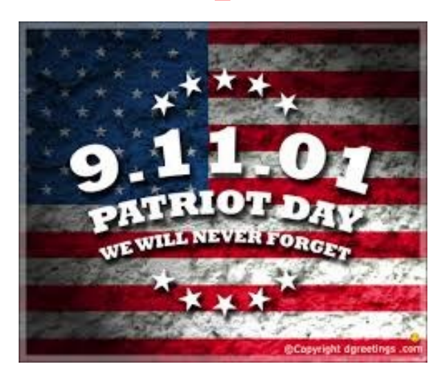
Over 3,000 died at the hands of terrorists. The War on Terror must go on for our Freedom.