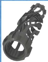
One piece scraper cage and centralizers