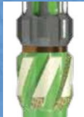
Integral string mill (Optional)