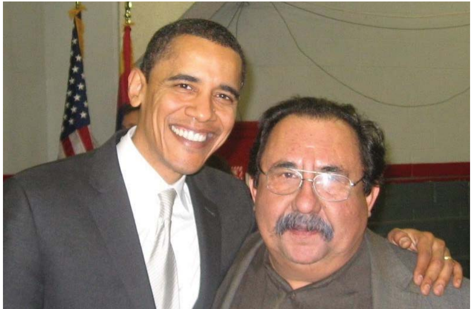
Supporting environmentalist pressure groups over national security: Rep. Raul Grijalva (right), an Arizona Democrat, with President Barack Obama. Grijalva favors legislation to make parkland on the U.S.-Mexico border off limits to the U.S. Border Patrol.

Summary: After 9/11 you would think that only the most radical environmental groups would dare attack the U.S. military as an enemy of the environment. But that's exactly what green groups are doing. Defense officials are alarmed that they are using the courts to pursue goals that interfere with what America needs for a strong national defense. Worse, their demands often appear to be mere pretexts for legal mischief to hamstring the military. Green groups are sending out teams of lawyers and waves of demonstrators to block national defense programs. If they succeed, they will stop weapons testing, interfere with naval training exercises, compromise U.S. border security measures, and frustrate the development of a ballistic missile defense.