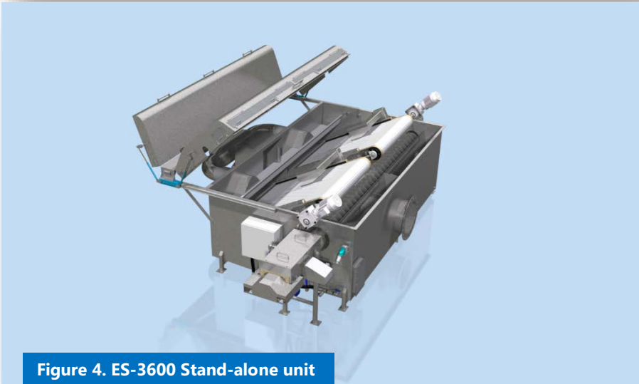
Figure 4. ES-3600 Stand-alone unit