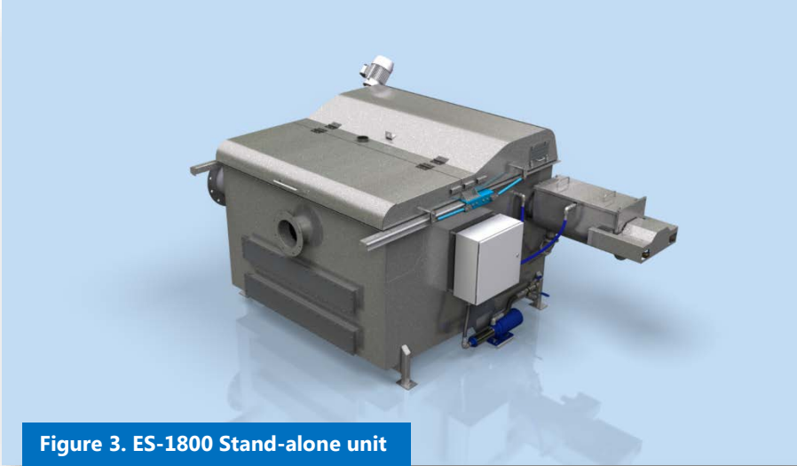
Figure 3. ES-1800 Stand-alone unit