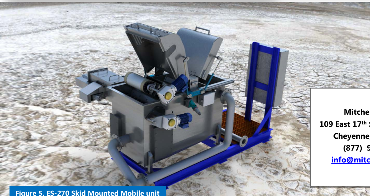
Figure 5. ES-270 Skid Mounted Mobile unit

The Mitcherson EcoSieve Models ES-270, ES-940, ES-1800 and ES-3400 are single belt machines. The ES-3600 is a duplex arrangement with 2 belt assemblies installed in one housing with one solids collection system. The EcoSieve can be provided as a stand-alone unit or mounted on a pre-wired skid platform which can drastically reduce field installation cost. Our skid units can be mobile units ready for deployment.