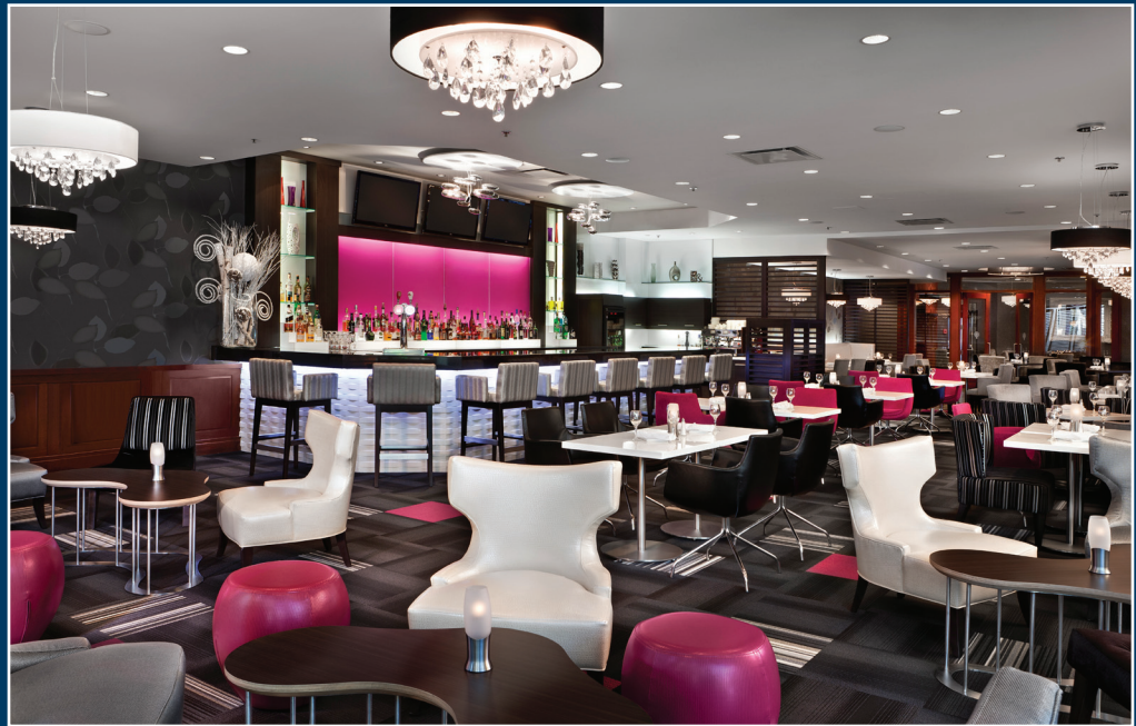
Quartz Restaurant and Lounge