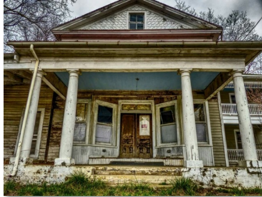
Purvis Store - Current State

PROJECT DESCRIPTION: Built in the early 1900s, the store and adjacent outbuilding are listed on the National Register of Historic Places as a Contributing Resource to the Southern Albemarle Rural Historic District and is listed on the Albemarle County Important Country Stores list along with two other stores in Esmont: Payne's Store and Pace's Store.