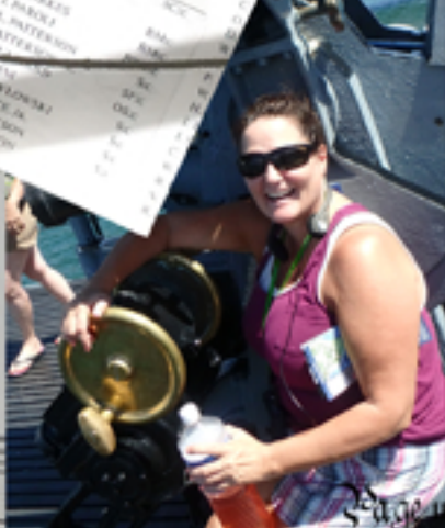
Pearl Harbor Memorial