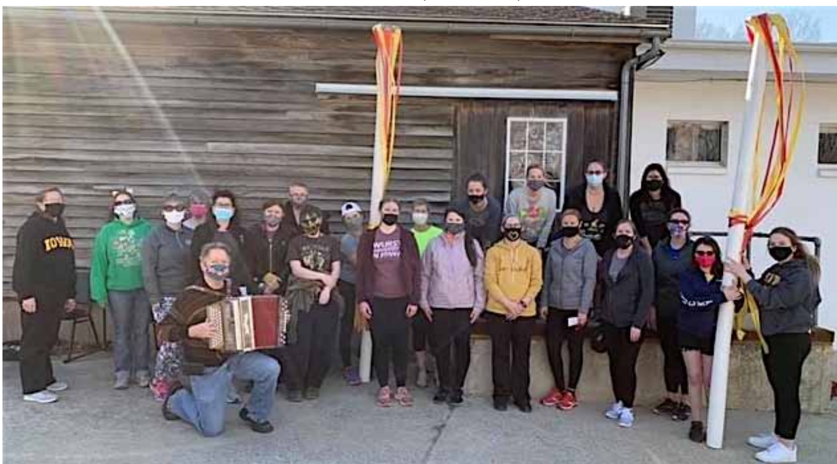
Below- First "covid" practice of Maipole dancers outside of the meat market