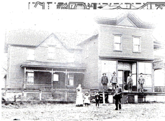
The Germania Hotel (today the Long Branch Tavern) in the 1890's