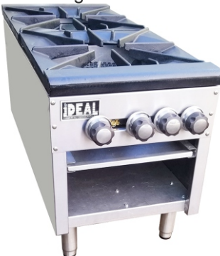
Stock Pot Ranges