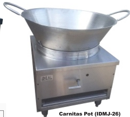
Carnitas Pot (IDMJ-26) Pot (Cazo) not included