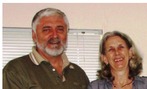
for these the Lord knows

COMING SOON 40 MINUTE Sept-Oct TMC walk thru on Drop Box