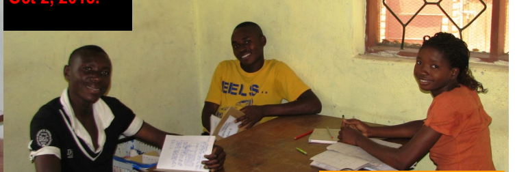
Secondary School Form Two beginning Sept (previously Form One)

TMC Secondary students were given bank accts (with money), and all needs including promises of tutors and future education including University (if they did well) They are now in classes of 70 to 80 to 90 students with one teacher crammed together in our Nov heat ..... Please pray for them to have relatives that will encourage them and for the discipline to carry thru. We miss them greatly.