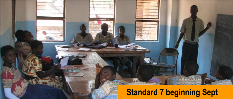
Standard 7 beginning Sept

For: the difference in their lives from what would have been to what is ... and will be !!!