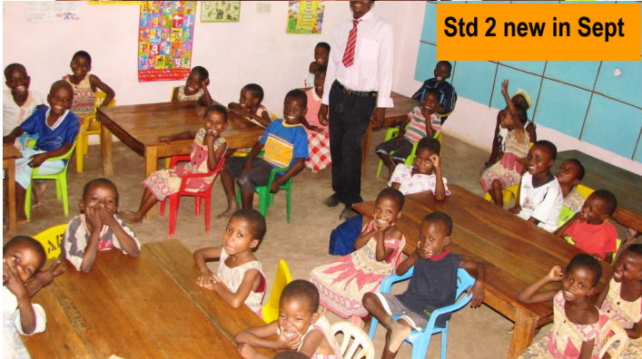
Std 2 new in Sept