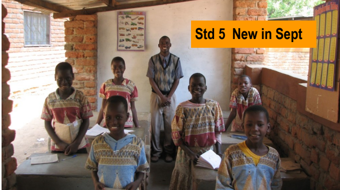
Std 5 New in Sept