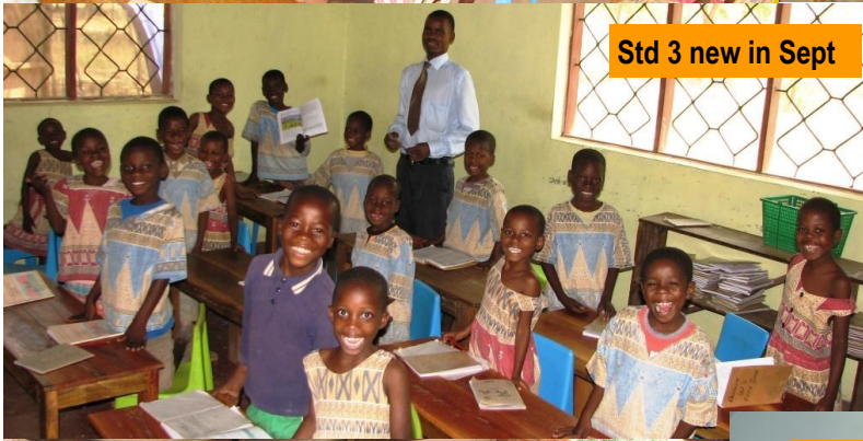
Std 3 new in Sept