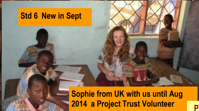
Std 6 New in Sept