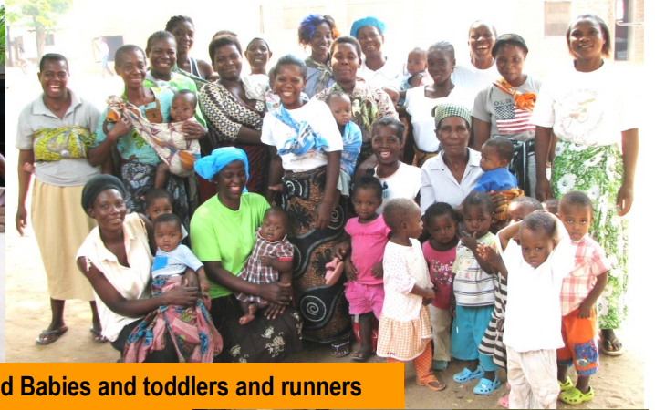
Ladies and Babies and toddlers and runners