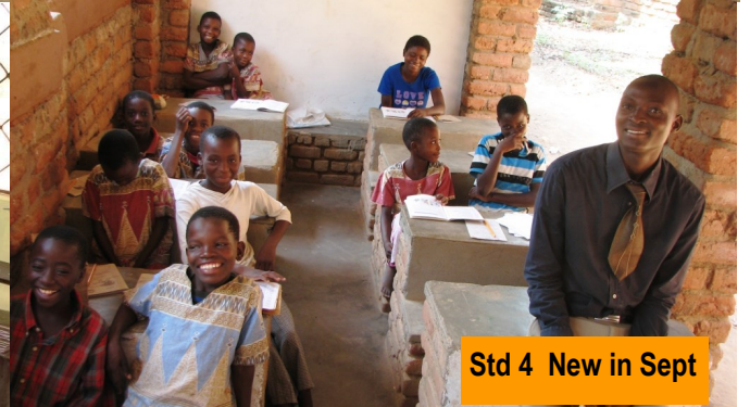
Std 4 New in Sept