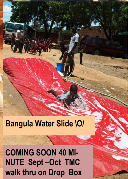
Bangula Water Slide \O/

COMING SOON 40 MINUTE Sept-Oct TMC walk thru on Drop Box