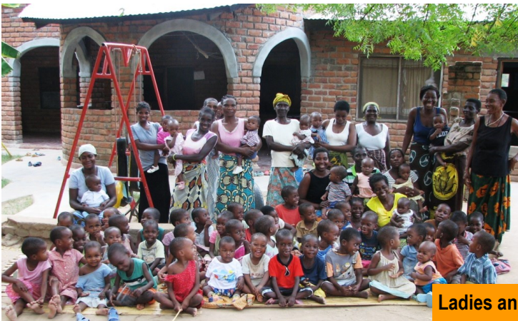
Oct 17th....a very welcome 3 day Government training for 1 of the 2 baby care teams