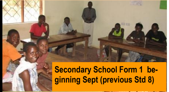
Secondary School Form 1 beginning Sept (previous Std 8)

Social Services notified us that we could not have a Secondary School on the same site as a Children's Home seems a bit strange as we are into our 3rd year \O/ They left Oct 2, 2013.