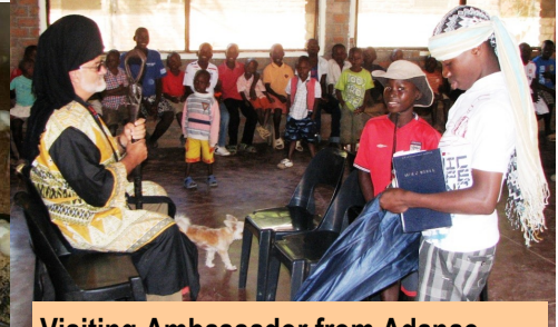
Visiting Ambassador from Adanac