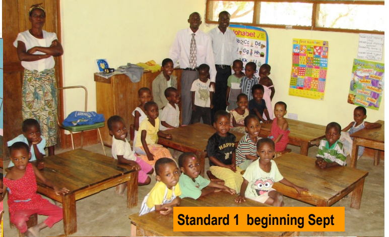
Standard 1 beginning Sept