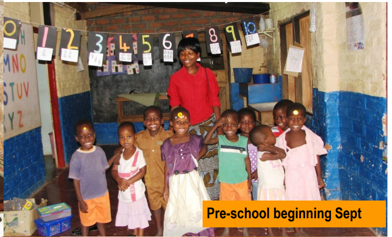
Pre-school beginning Sept