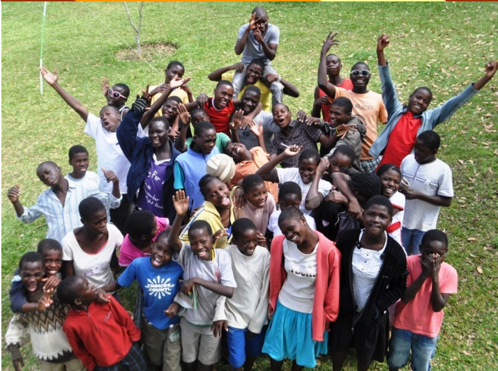
TMC 12 yrs and older at YWAM Camp A WONDERFUL TIME!