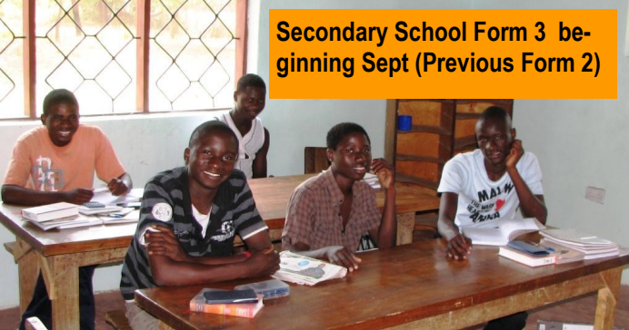
Secondary School Form 3 beginning Sept (Previous Form 2)