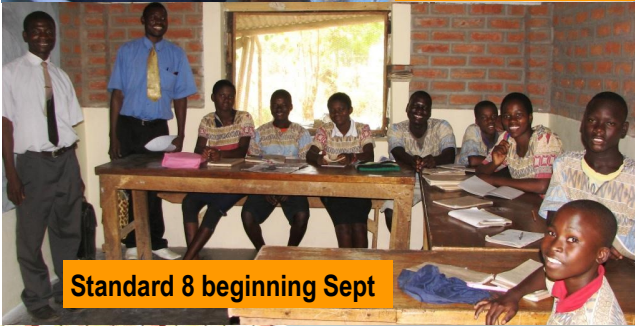
Standard 8 beginning Sept

Social Services notified us that we could not have a Secondary School on the same site as a Children's Home seems a bit strange as we are into our 3rd year \O/ They left Oct 2, 2013.