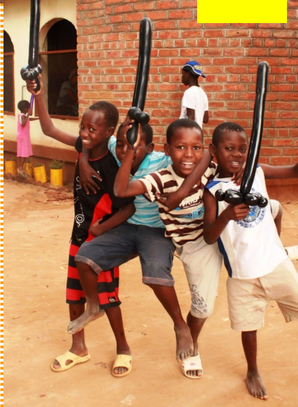
The 3 plus 1 Musketeers "ON GUARD"