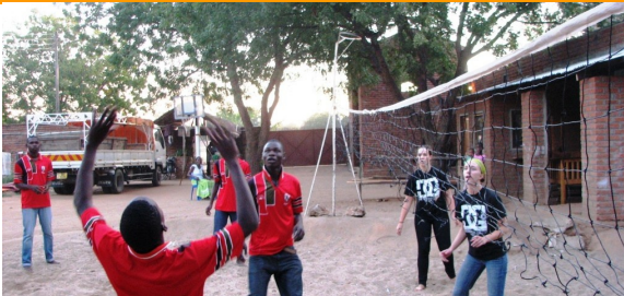
Volley ball with Fairway Church ... always fun !!!

Fairway Church in Grand Rapids MI loaned us these new friends and Kris an older one!