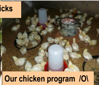
Our chicken program \O\