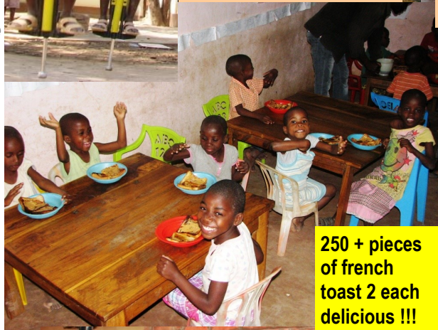
250 + pieces of french toast 2 each delicious !!!