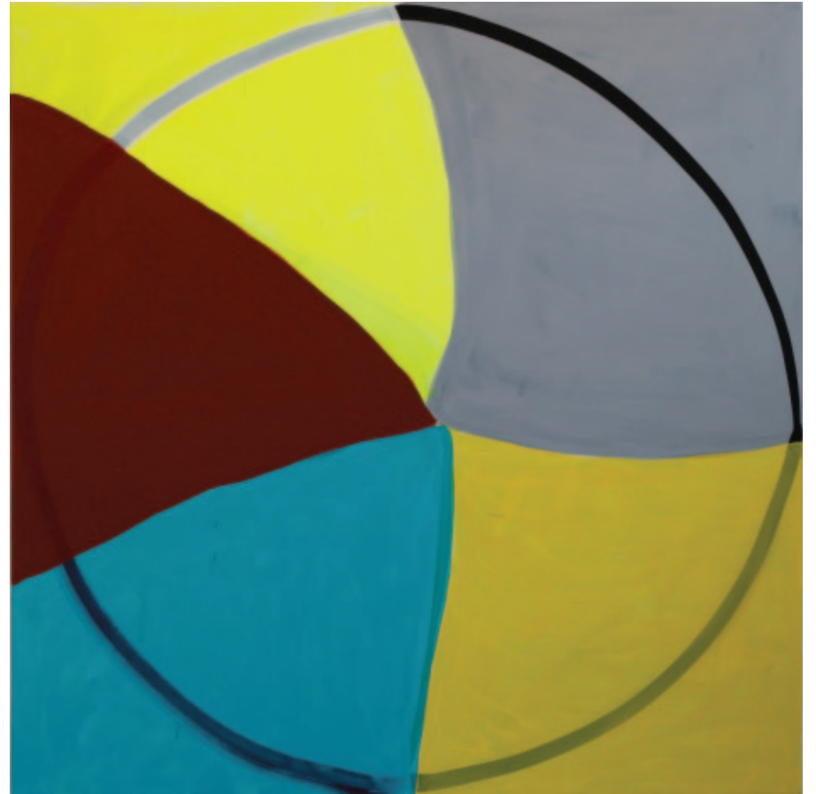
BODY LOGIC 2011