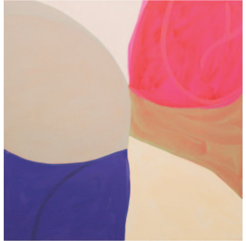
40 WATT MOON 2010