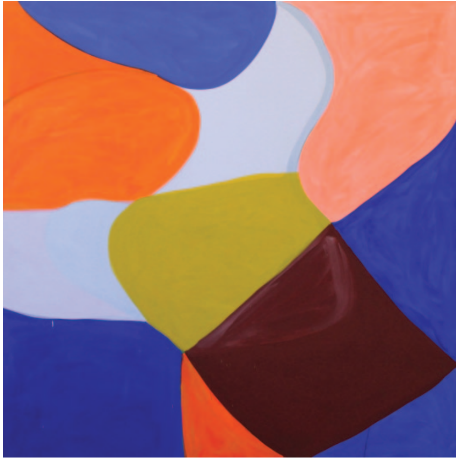
AFTERNOON OF A FAUN 2011