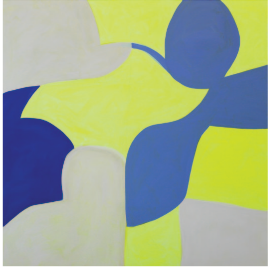
THE BLACK SEA CONVERSING WITH THE ATLANTIC OCEAN AN HOUR BEFORE DAWN 2011