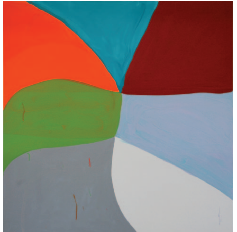
MY HEART YOUR HEART 2010