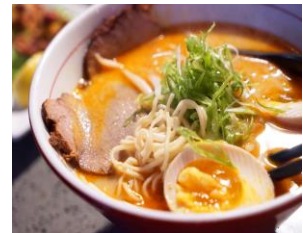
Ramen Noodle Soup