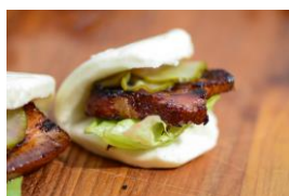
Pork Belly Bun