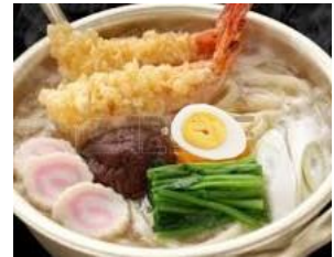
Nabeyaki Udon Noodle Soup