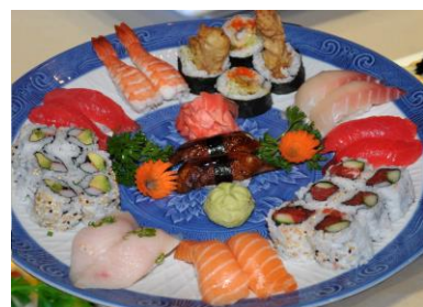
Sushi for Two