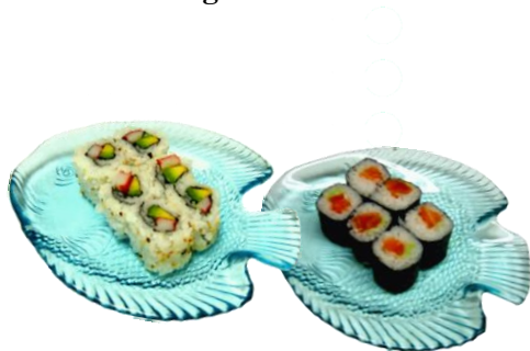
Sample of California Roll and Tuna Roll