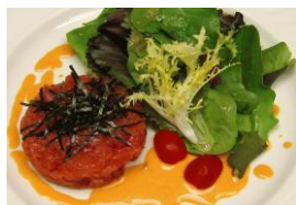
Spicy Tuna Salad