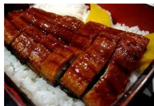
Una - Ju