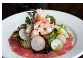
Lobster & Tuna Salad