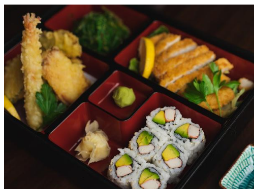
Pork Katsu Bento