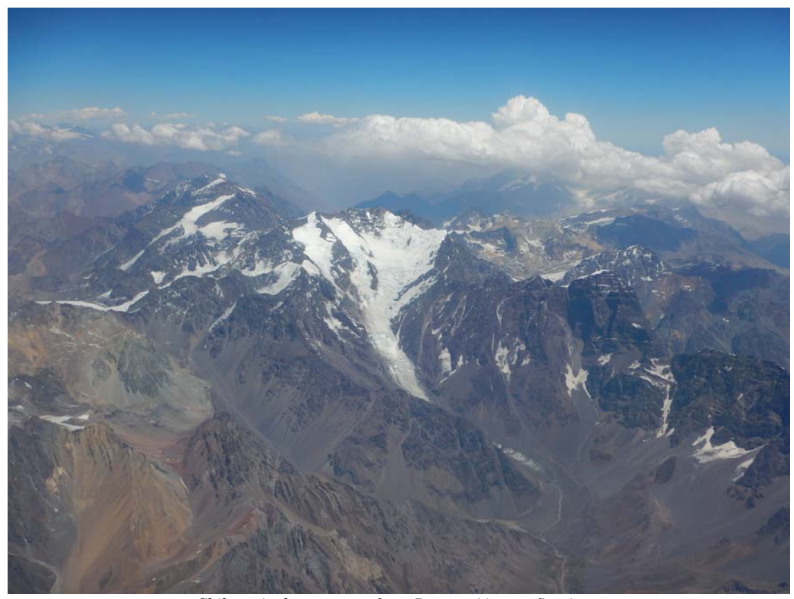
Chilean Andes en-route from Buenos Aires to Santiago