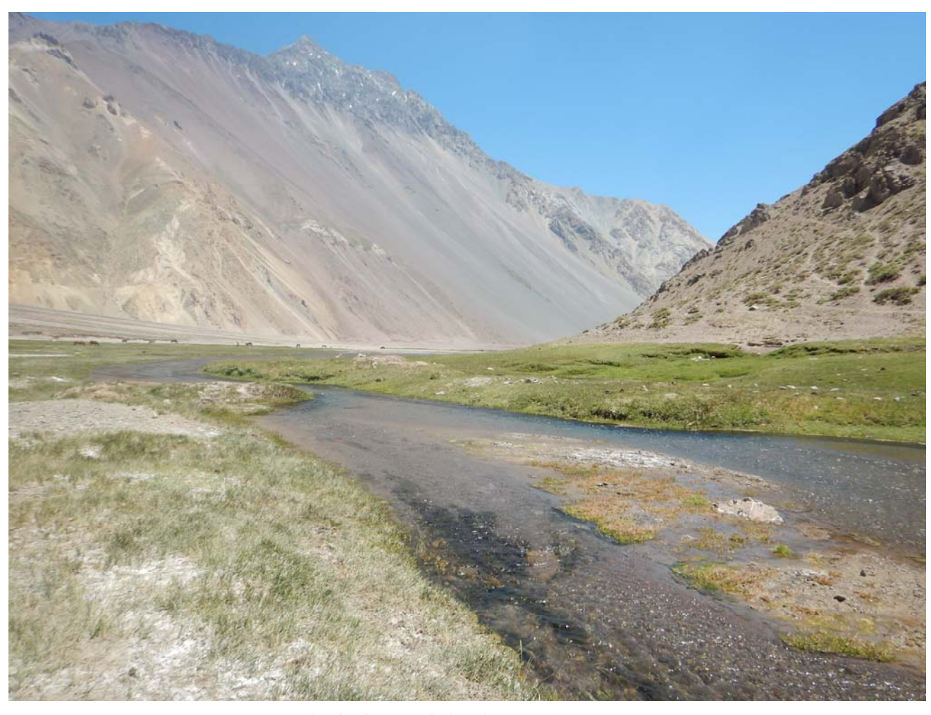
Wetlands above Embalse el Yeso @ 2,500m ASL