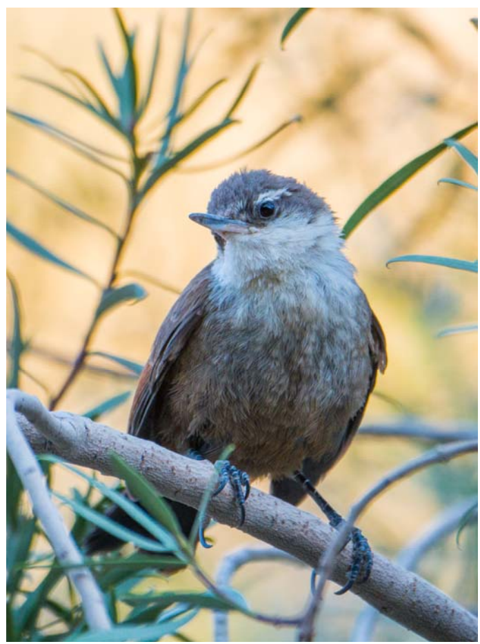
Crag Chilia [Valle del Yeso @ 1,400m ASL]