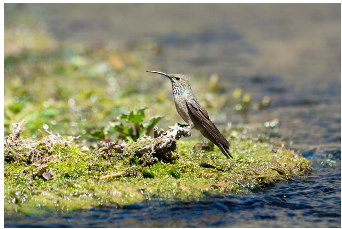
White-sided Hillstar (female, or possibly immature male?) [Valle del Yeso @ 2,500m ASL]