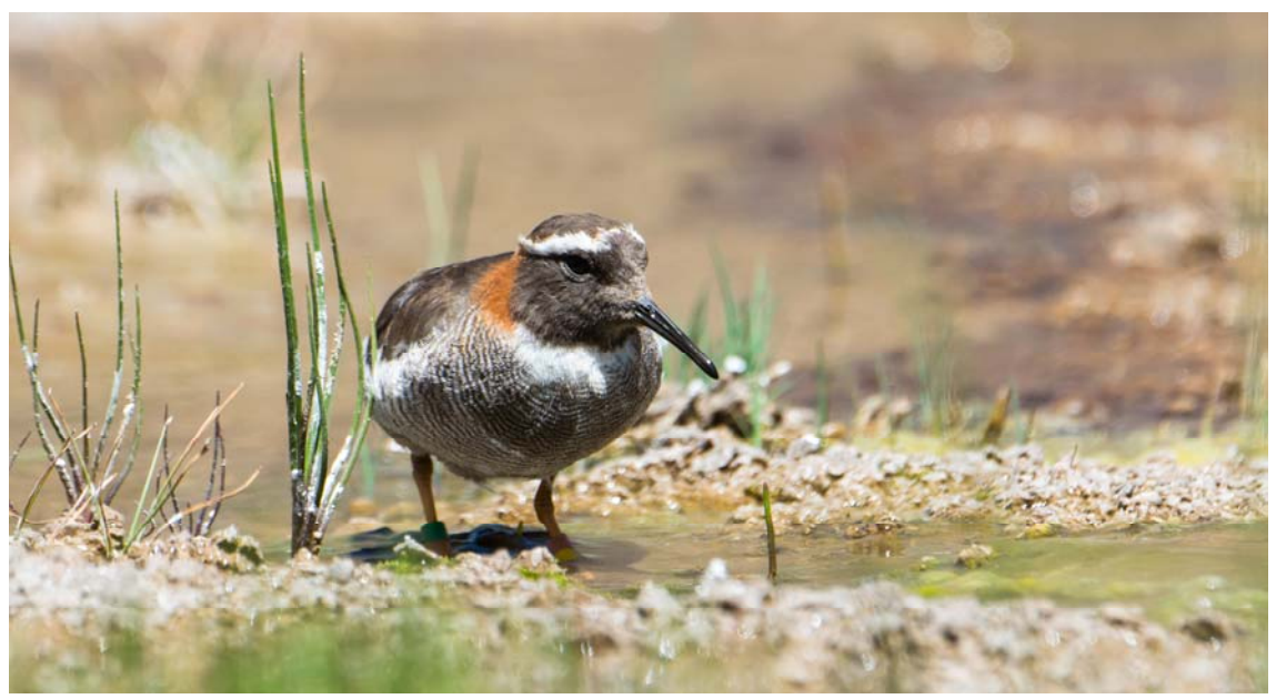
Diademed Sandpiper-Plover [Valle del Yeso @ 2,500m ASL]

During a weekend in Santiago indulging in the ever tempting pisco sours, red wine and cerviche , I spent a full day birding in the spectacular Valle del Yeso in the company of Feña Díaz (fernando@albatrossbirding.com), followed by a morning birding alone whilst using a local taxi to ascend, via Farellones, to the Valle Nevada ski resort.