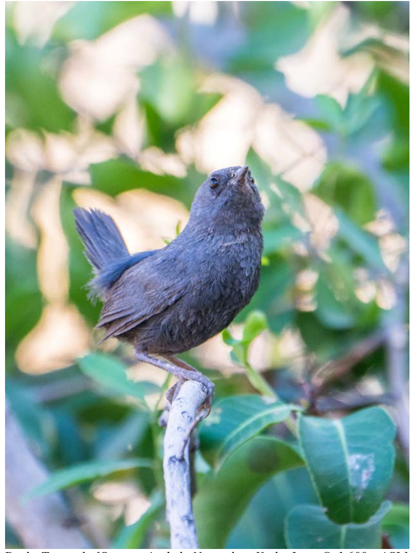
Dusky Tapaculo [Sanctuario de la Naturaleza Yerba Loca @ 1,600m ASL]