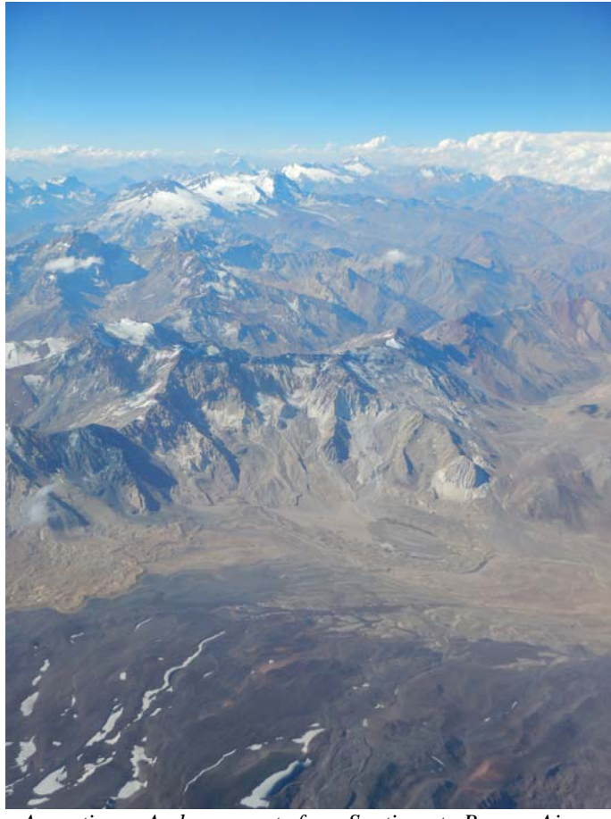
Argentinean Andes en-route from Santiago to Buenos Aires