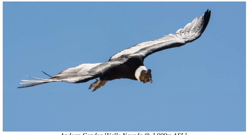
Andean Condor [Valle Nevada @ 3,000m ASL]

The dry Andean scenery, offset against bright blue skies, was amazing and my two birding outings were very productive despite the summer weather being especially hot and sunny (reaching 35°C in the afternoon in Santiago and still very warm even at the highest altitude that I visited of ~3,000m ASL). Highlights included eyeball-to-eyeball views of a confiding pair of Diademed Sandpiper-Plovers (with a fledgling) as they wandered around a wetland in the upper Valle el Yeso, excellent views of six Chilean endemics (including three tapaculo species), and close encounters on both days with several Andean Condors that provided me with an up-close-and-personal appreciation of their 3.2m wingspan. Of the 49 species identified, 21 were lifers. This report includes a summary of the locations visited and species seen.