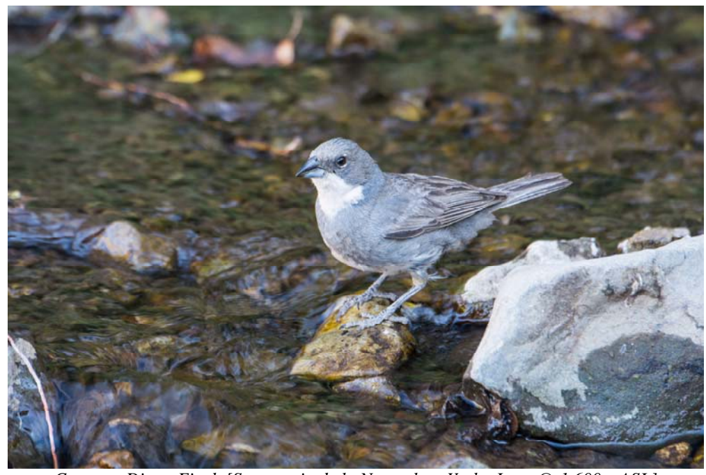
Common Diuca-Finch [Sanctuario de la Naturaleza Yerba Loca @ 1,600m ASL]