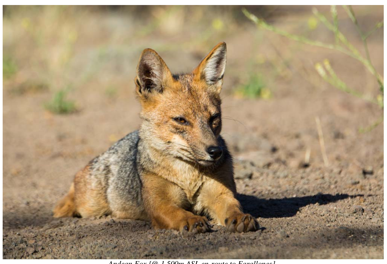
Andean Fox [@ 1,500m ASL en-route to Farallones]