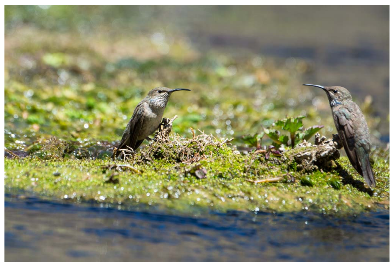
White-sided Hillstars (females, or possibly immature males?) [Valle del Yeso @ 2,500m ASL