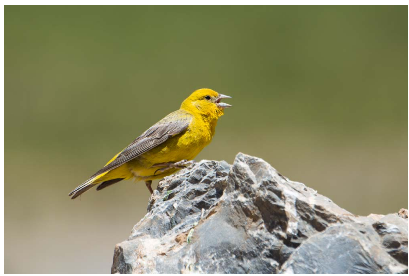
Greater Yellow-Finch [Valle del Yeso @ 2,500m ASL]