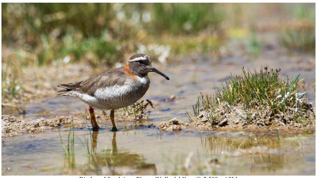
Diademed Sandpiper-Plover [Valle del Yeso @ 2,500m ASL]