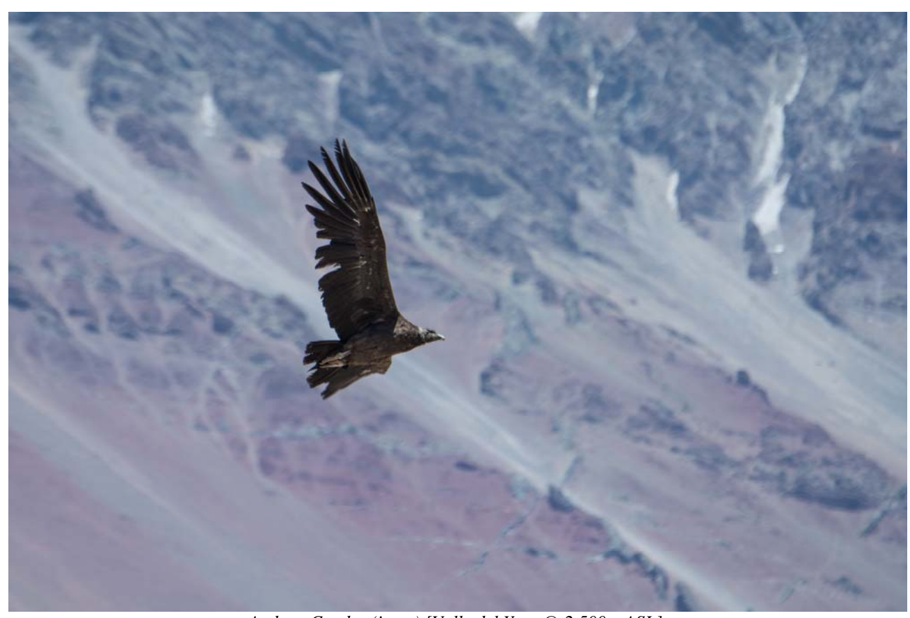
Andean Condor (imm.) [Valle del Yeso @ 2,500m ASL]