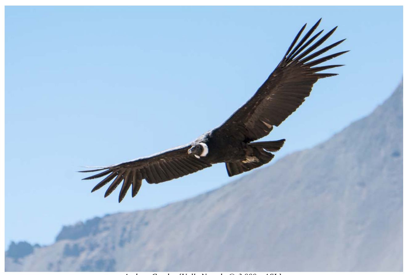
Andean Condor [Valle Nevada @ 3,000m ASL]