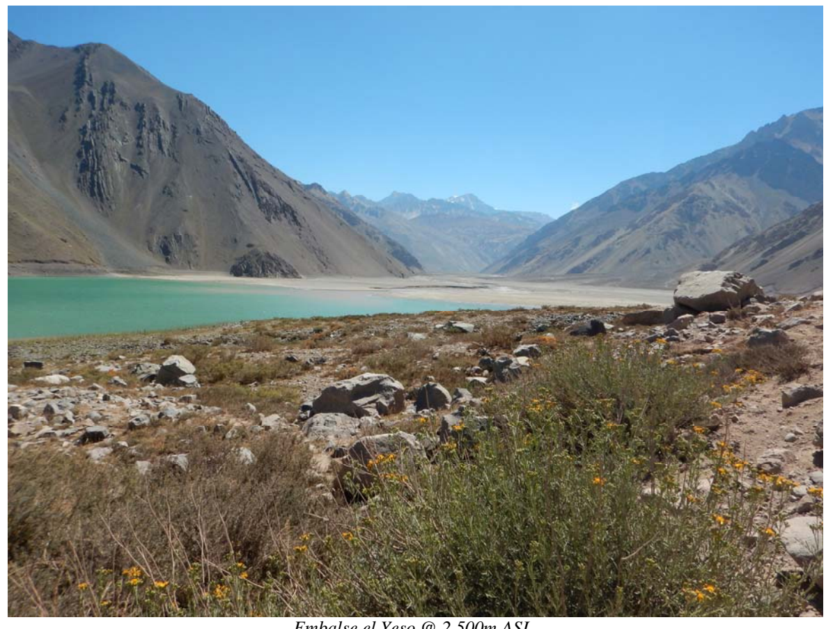
Embalse el Yeso @ 2,500m ASL