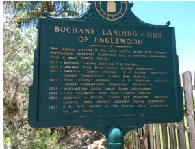
6 Buchan's Landing 599 W. Dearborn St.