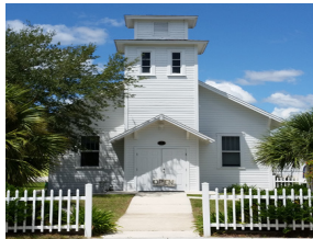
7 Green St. Church Museum 416 W. Green St.