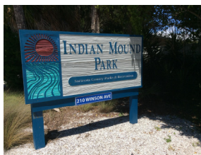
8 Indian Mound Park 210 Winson Ave.