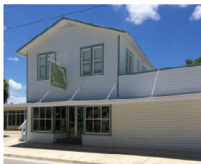
9 Old Florida (Hardware) Store 463 W. Dearborn St.