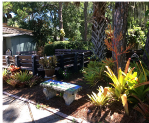
3 Lemon Bay Garden Club 480 Yale St.