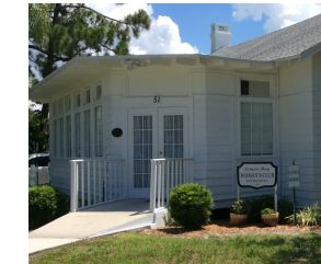
11 Lemon Bay Women's Club 51 Maple St.