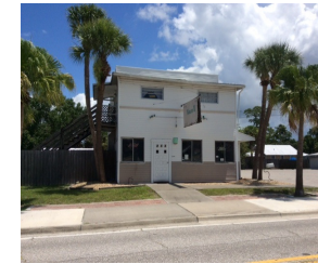
10 Kelly's Tavern 232 W. Dearborn St.