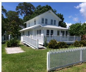
4 Lampp House 604 W. Perry St.

Not open for tour Call for availability 941-474-5548