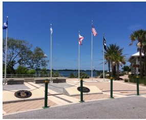
5 The Veterans Memorial 10 Harbor Lane