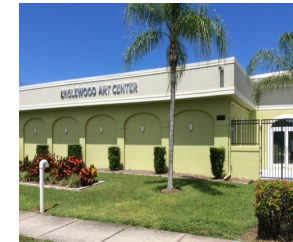
12 Englewood Art Center 350 S. McCall Rd.

Not open for tour Call for availability 941-474-5548