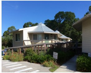
1 Englewood Museum 1398 Old Englewood Rd.