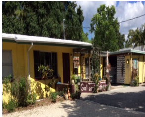
2 The Open Studio 380 Old Englewood Rd.