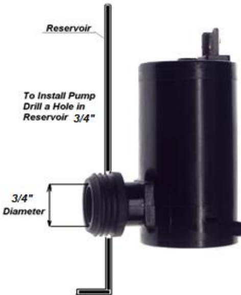
Autex spray pump