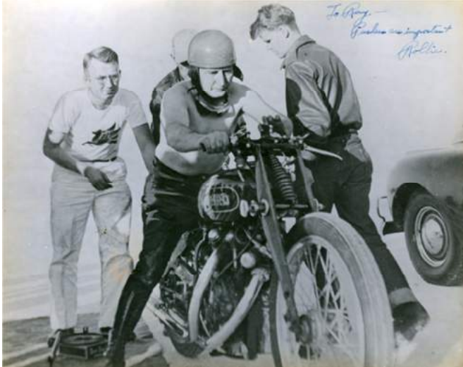
Rollie Free at Bonneville Salt Flats: "Pushers are important"