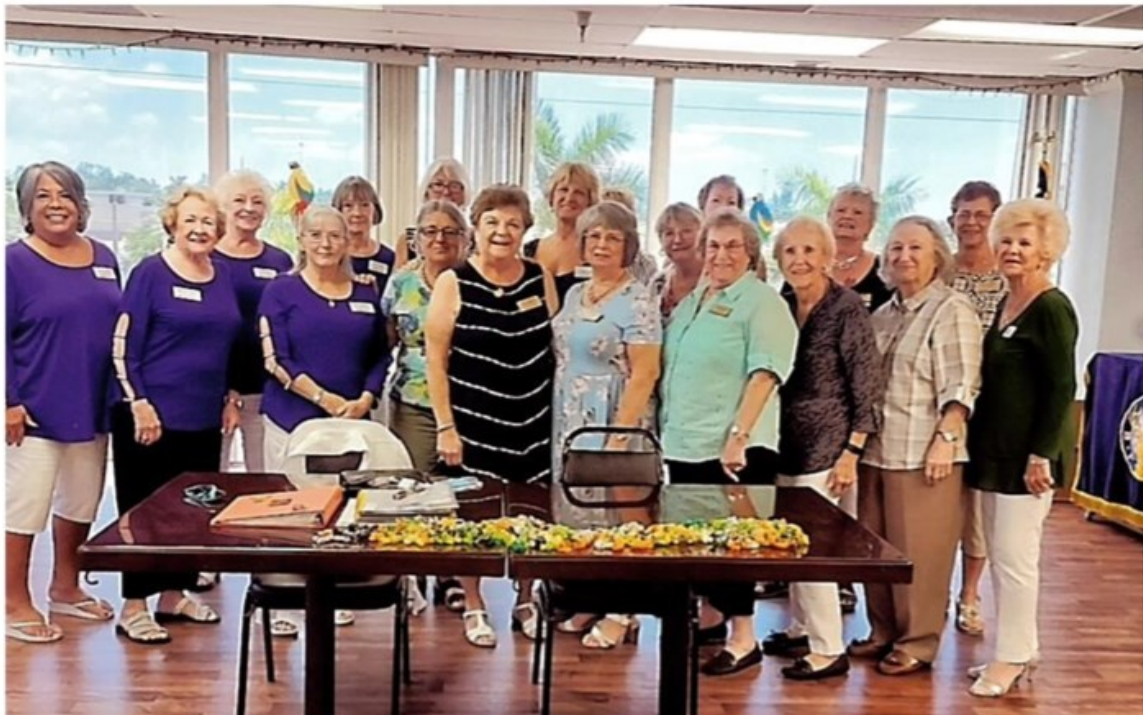
FLOE Meeting at Fort Myers Elks on August 19th. Six ladies from Punta Gorda attended