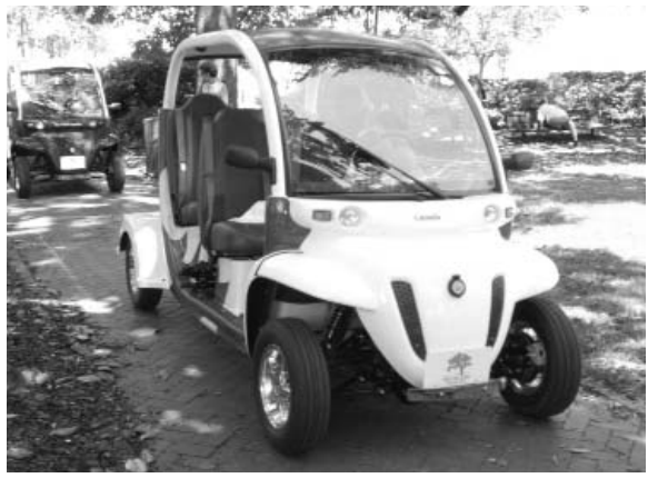
DaimlerChrysler's GEM neighborhood electric vehicle

neighborhood electric vehicles and the upgraded 2006 model year line-up. Jan. 24 marks the start of a 15-city tour that begins in San Diego and wraps up in late March in North Carolina. At this point more than 30,000 GEM vehicles are in use across the United States and internationally,