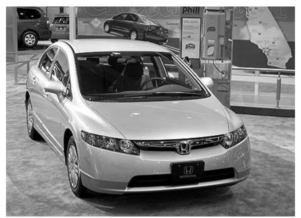
Honda's CNG powered Civic GX

American Honda Motor Co., Inc., debuted its new compressed natural gas (CNG) powered Civic GX at the L.A. show. The cars are scheduled to go on sale at select Honda dealers throughout California in May. The Civic