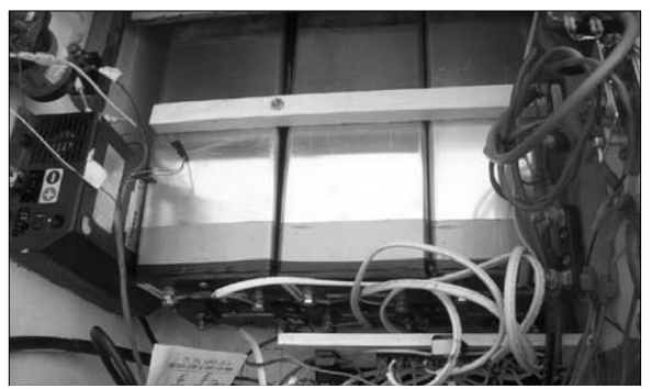
The Evolution Li ion battery pack in the coach boat; a version will be installed in the Olympian EV.

"I guess we can run all winter, except for the worst days."