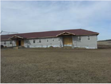
Spokane Hutterite School