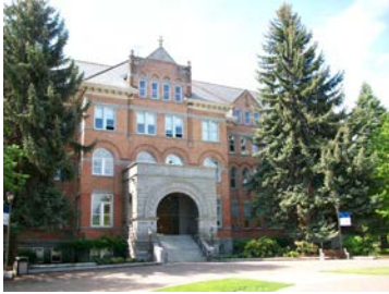
Gonzaga University College Hall