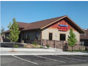
Liberty Lake Children's Academy