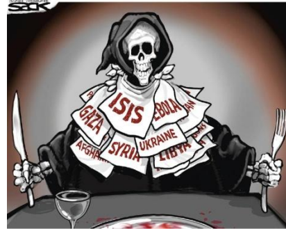
Minneapolis Star Tribune - 8-21-14