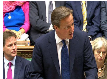
British Prime Minister David Cameron

U. K. Prime Minister David Cameron “one ups” Obama – While the U.S. is denying the level of direct Islamist terrorist threat to our nation, the U.K.’s PM David Cameron raised the official threat measurement to the highest level, then he did a mea culpa by reversing (very un-Obama-like) a previous official position – he announced the introduction of certain anti-terrorist “relocation powers” a measure he previously scrapped.